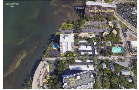
Built in 1975 - 53 units - 14 floors

Prelude 80 Condominium Address: 80 Rogers St, Clearwater, FL 33756, Phone: +1 727-443-7737 http://www.prelude80.com/