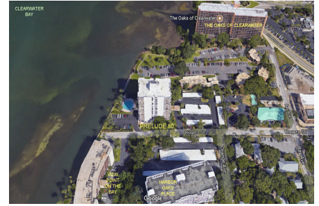
Built in 1975 - 53 units - 14 floors

Prelude 80 Condominium Address: 80 Rogers St, Clearwater, FL 33756, Phone: +1 727-443-7737 http://www.prelude80.com/