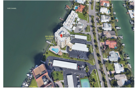
Built in 1975 - 31 units - 8 floors

Sea Island South Condo IV Address: 750 Island Way, Clearwater, FL 33767