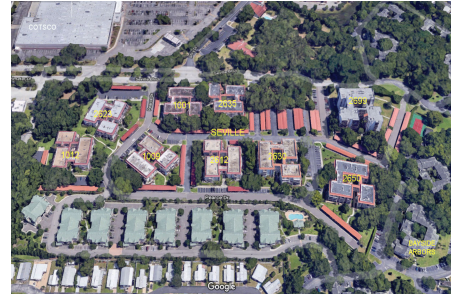
Built in 1972 - 370 units - 8 floors

Seville Condo Association ADDRESS 1001 Pearce Dr Clearwater FL 33764-1145 PHONE (727) 712-3137