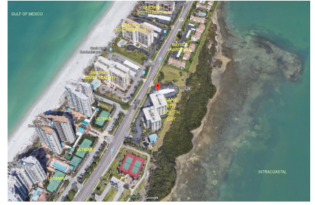
Built in 1983 - 64 units - 8 floors

South Bay Condominiums on Sand Key Address: 1501 Gulf Blvd, Clearwater, FL 3376 Phone: +1 727-698-7249