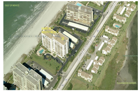
Built in 1980 - 141 units - 12 floors

Clearwater Key Association South Beach 1460 Gulf 2870 Scherer Drive N # 100 Saint Petersburg, FL 33716 (727) 517-1460