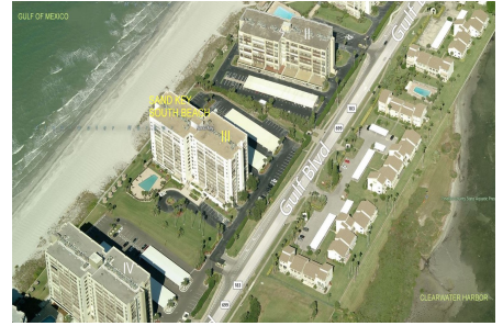
Built in 1980 - 141 units - 12 floors

Clearwater Key Association South Beach 1460 Gulf 2870 Scherer Drive N # 100 Saint Petersburg, FL 33716 (727) 517-1460