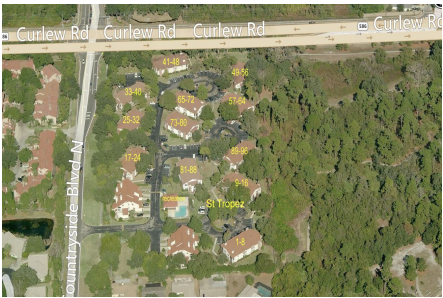
Built in 1984 - 108 units - 2 floors

St. Tropez Condominium Association Inc 3455 Countryside Blvd Apt 105 Clearwater, Florida 33761 (727) 464-7991