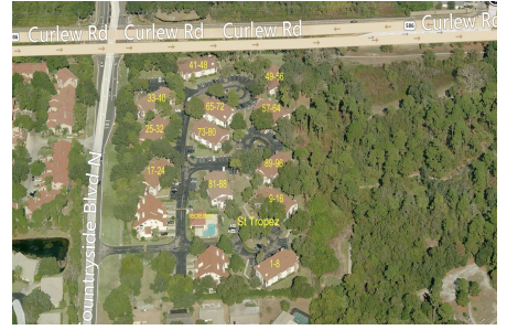
Built in 1984 - 108 units - 2 floors

St. Tropez Condominium Association Inc 3455 Countryside Blvd Apt 105 Clearwater, Florida 33761 (727) 464-7991