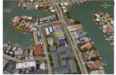
Built in 1978 - 184 units - 17 floors

Clipper Cove Condominiums Address: 400 Island Way, Clearwater, FL 33767 Phone: +1 727-446-6014