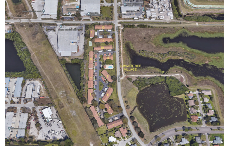
Built in 1982/1997 - 84 units - 2 floors