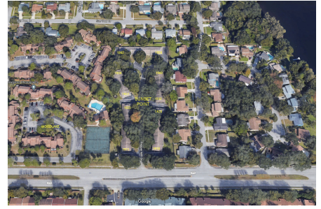
Built in 1983 - 31 units - 1 floor

Number of units: 31 Number of active listings for rent: 0 Number of active listings for sale: 0 Building inventory for sale: Number of sales over the last 12 months: 0% Number of sales over the last 6 months: 0 Number of sales over the last 3 months: 0