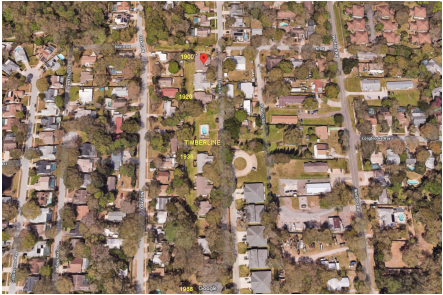
Built in 1986 - 21 units - 1 floor