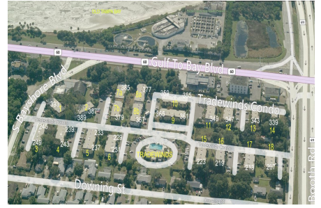
Built in 1974 - 204 units - 2 floors

TRADEWINDS EAST CONDOMINIUM ASSOCIATION 251 S McMullen Booth Rd Clearwater, FL 33759-4425 (727) 585-3491