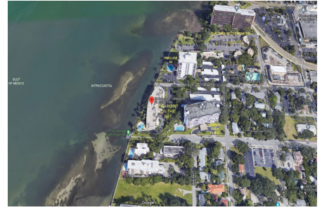
Built in 1981 - 35 units - 6 floors

Viewpoint Condominium Association, 55 Rogers St., Clearwater, FL 33756 https://www.viewpointonthebay.com/