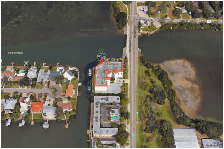
Built in 2005 - 24 units - 4 floors