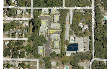
Built in 1974 - 88 units - 2 floors

Victoria Palms of Dunedin Condominium Association Address: 700 Lyndhurst St, Dunedin, FL 34698, Phone: +1 727-734-0319 http://victoriapalmshoa.com/