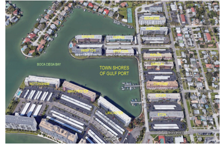
Built in 1971 - 41 units - 3 floors

Town Shores Master Association, Inc 3210 59th Street South Gulfport, FL 33707 Phone: (727) 345-9491 contact@townshorescommunity.com https://www.townshorescommunity.com/welcom