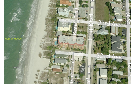
Built in 2005 - 18 units - 4 floors

SCOPELLO CONDOMINIUM ASSOCIATION, INC. LEADING EDGE COMMUNITY ASSOCIATION MANAGER 901 N HERCULES AVE STE A CLEARWATER FL 33765 PHONE 727-461-9770 FAX 727-461-9775 EMAIL SERVICE@LEADINGEDGECAM.COM