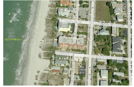
Built in 2005 - 18 units - 4 floors

SCOPELLO CONDOMINIUM ASSOCIATION, INC. LEADING EDGE COMMUNITY ASSOCIATION MANAGER 901 N HERCULES AVE STE A CLEARWATER FL 33765 PHONE 727-461-9770 FAX 727-461-9775 EMAIL SERVICE@LEADINGEDGE.COM