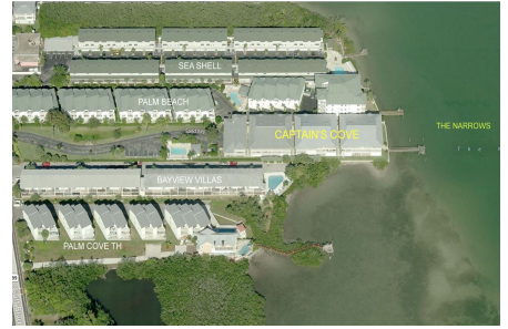
Built in 2002 - 27 units - 2 floors

CAPTAIN'S COVE OF INDIAN SHORES CONDOMINIUM ASSOCIATION, INC. S/3 CONSULTING GROUP 19534 GULF BLVD # 202 INDIAN SHORES FL 33785 727-593-1420