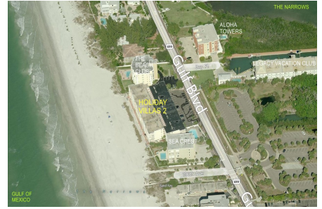
Built in 1973 - 72 units - 4 floors

HOLIDAY VILLAS II, CONDOMINIUM, INC. 7300 PARK STREET SEMINOLE FL 33777 5901 SUN BLVD ST PETERSBURG FL PHONE 727-581-2662 FAX 727-584-2118