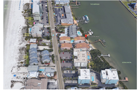
Built in 1981 - 16 units - 3 floors

Indian Sands Condominium Association, Inc. Address: 19937 Gulf Blvd C, Indian Shores, FL 33785