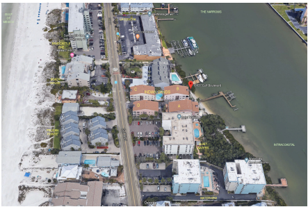
Built in 1981 - 16 units - 3 floors

Indian Sands Condominium Association, Inc. Address: 19937 Gulf Blvd C, Indian Shores, FL 33785