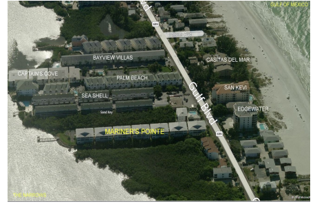
Built in 2001 - 30 units - 3 floors

Number of units: 30 Number of active listings for rent: 0 Number of active listings for sale: 0 Building inventory for sale: Number of sales over the last 12 months: 0%% Number of sales over the last 6 months: 0 Number of sales over the last 3 months: 0