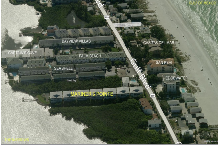
Built in 2001 - 30 units - 3 floors