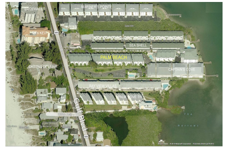
Built in 2004 - 28 units - 3 floors

19534 GULF BLVD # 202 INDIAN SHORES FL 33785 Phone: (727)-593-1420