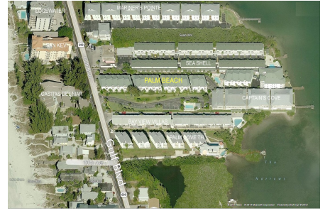
Built in 2004 - 28 units - 3 floors

19534 GULF BLVD # 202 INDIAN SHORES FL 33785 Phone: (727)-593-1420