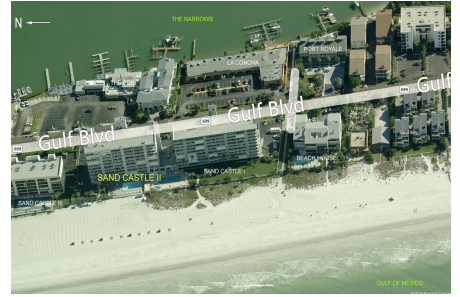
Built in 1979 - 52 units - 10 floors

Sandcastle II Condominium Association Inc 720 S Collier Blvd Marco Island, FL 34145 Phone number (239) 642-0779