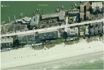
Built in 1979 - 52 units - 10 floors

Sandcastle II Condominium Association Inc 720 S Collier Blvd Marco Island, FL 34145 Phone number (239) 642-0779