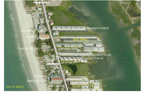
Built in 1981 - 45 units - 3 floors

SEA SHELL OF INDIAN SHORES CONDOMINIUM ASSOCIATION, INC. SHADOW LAKES MANAGEMENT COMPANY 10825 SEMINOLE BLVD # 1 LARGO FL 33778 PHONE 727-397-1192