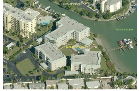
Built in 1998 - 60 units - 3 floors

Madeira Cove Condominium Association Professional Bayway Management 70 Lake Carillon Drive St. Petersburg FL 33716 Phone: 727-866-3115 http://www.madeiracove.info/