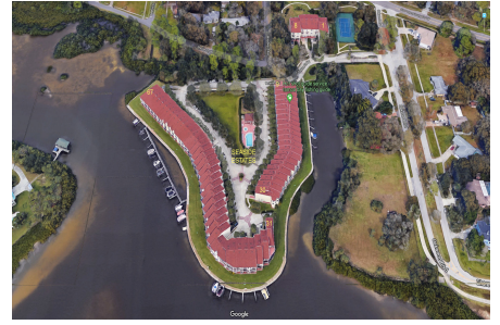
Built in 2003 - 67 units - 3 floors

Number of units: 67 Number of active listings for rent: 0 Number of active listings for sale: 3 Building inventory for sale: 4% Number of sales over the last 12 months: 3 Number of sales over the last 6 months: 0 Number of sales over the last 3 months: 0