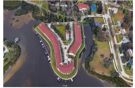
Built in 2003 - 67 units - 3 floors