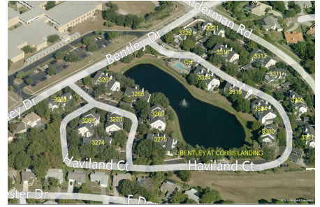
Built in 1990 - 200 units - 3 floors

Bentley At Cobbs Landing 3320 Haviland Ct Palm Harbor, FL 34684 (727) 789-1476 http://www.thebentleyatcobbslanding.com/