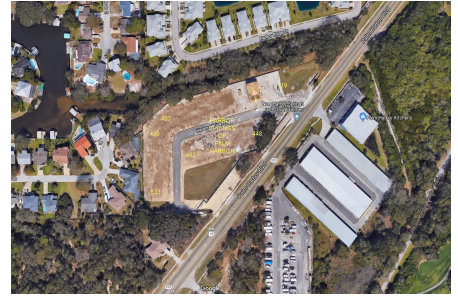
Built in 2017 - 32 units - 2 floors