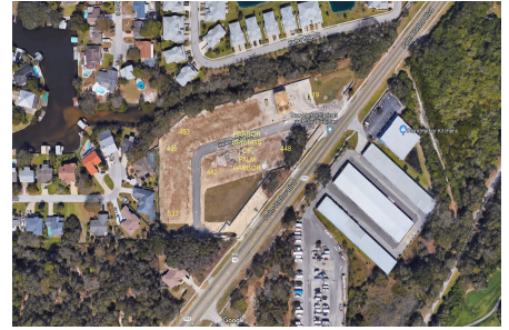
Built in 2017 - 32 units - 2 floors