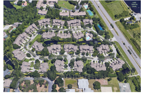
Built in 1985/1988 - 152 units - 2 floors

Landmark Oaks Condo Assoc 3000 Landmark Blvd, Palm Harbor, FL 34684 (727) 787-8365