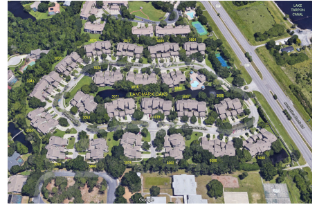
Built in 1985/1988 - 152 units - 2 floors

Landmark Oaks Condo Assoc 3000 Landmark Blvd, Palm Harbor, FL 34684 (727) 787-8365