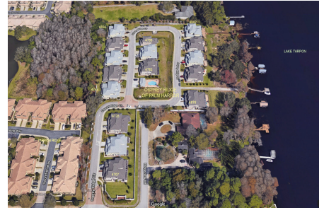
Built in 2013 - 31 units - 2 floors

Osprey Ridge of Palm Harbor Homeowners Association 4707 Osprey Ridge Cir, Palm Harbor, FL 34684 (727) 943-809