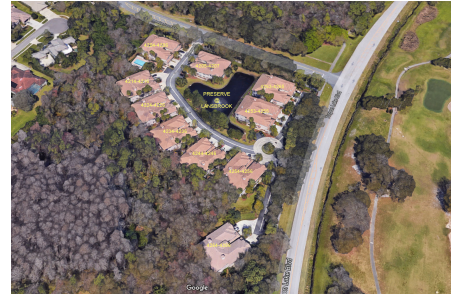
Built in 1997/2000 - 40 units - 2 floors

Lansbrook Master Association Address: 5025 Highpoint Dr, Palm Harbor, FL 34685 Phone: +1 727-943-7076 http://lansbrooktampabay.com/