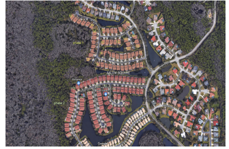
Built in 1991/2000 - 258 units - 1 floor

Number of units: 258 Number of active listings for rent: 0 Number of active listings for sale: 0 Building inventory for sale: Number of sales over the last 12 months: 0% Number of sales over the last 6 months: 0 Number of sales over the last 3 months: 0