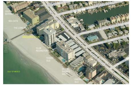
Built in 1982 - 42 units - 6 floors

Anglers Cove address: Anglers Cove 17450 Gulf Blvd. Redington Shores, FL 33708 phone: 727.392.6366 fax: 727.394.2683 http://anglerscove.com/