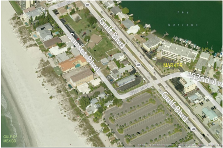
Built in 1980 - 20 units - 4 floors

MARKER "5" CONDOMINIUM ASSOCIATION, INC. QUALIFIED PROPERTY MANAGEMENT 7210 N MAHATTAN AVE TAMPA FL PHONE 727-869-9700 FAX 727-869-9825