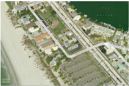
Built in 1980 - 20 units - 4 floors

MARKER "5" CONDOMINIUM ASSOCIATION, INC. QUALIFIED PROPERTY MANAGEMENT 7210 N MAHATTAN AVE TAMPA FL PHONE 727-869-9700 FAX 727-869-9825