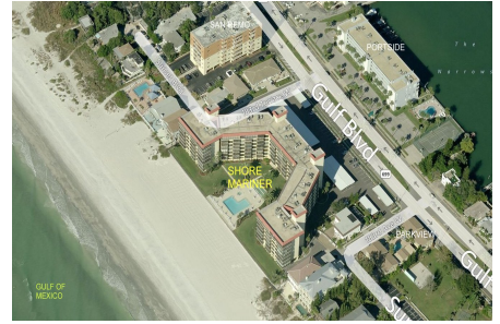
Built in 1975 - 120 units - 7 floors

Shore Mariner Condominium Association Address: 18304 Gulf Blvd, Redington Shores, FL 33708 Phone:(727) 393-8137 http://www.shoremariner.net/