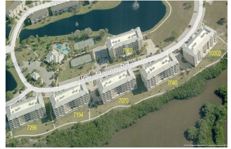
Built in 2005 - 180 units - 6 floors