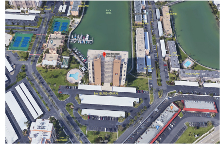
Built in 1980 - 94 units - 18 floors

Bay Island Group Address: 7490 Bay Island Dr S, South Pasadena, FL 33707 Phone: +1 727-360-2751