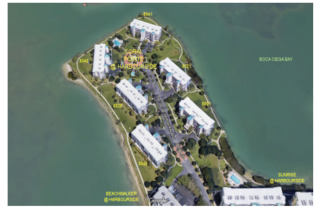
Built in 1991 - 140 units - 5 floors

Harbour Side Condos At South Pasadena 7886-7970 Sailboat Key Blvd S, South Pasadena, FL 33707 Phone: +1 727-367-5054