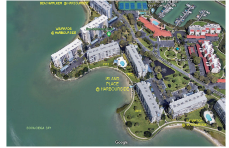
Built in 1987 - 144 units - 7 floors

http://www.associationvoice.com/page/35712-622634/Welcome-to-The-HarbourSide-Com