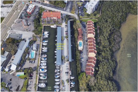
Built in 1985 - 35 units - 4 floors