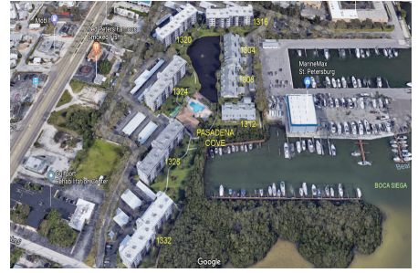
Built in 1983 - 256 units - 6 floors

Pasadena Cove Owners Assn Inc 3001 Executive Drive # 260 Clearwater, FL 33762 Phone: (727) 687-9368 Pasadena Cove Owners 1328 Pasadena Ave S South Pasadena, FL 33707 Phone: (727) 345-5963