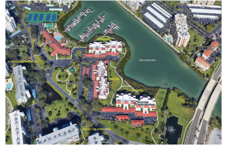
Built in 1981 - 32 units - 4 floors

Number of units: 32 Number of active listings for rent: 1 Number of active listings for sale: 0 Building inventory for sale: Number of sales over the last 12 months: 0% Number of sales over the last 6 months: 1 Number of sales over the last 3 months: 0