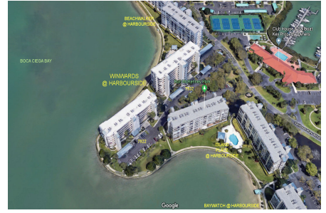
Built in 1988 - 108 units - 9 floors