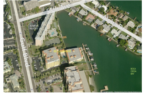
Built in 2006 - 27 units - 5 floors

BELLA GRANDE HOMEOWNER'S ASSOCIATION, INC. PROFESSIONAL BAYWAY MANAGEMENT COMPANY INC 5901 SUN BLVD STE 203 ST PETERSBURG FL 33715 PHONE 727-866-3115