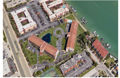
Built in 1985 - 58 units - 3 floors

Bridgehampton Bay Condominium Association, Inc. 8701 Blind Pass Rd St Pete Beach FL33706