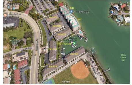
Built in 1996/2000 - 105 units - 5 floors

Captiva Cay Homeowner's Association, Inc 9333 Blind Pass Road Saint Pete Beach, FL 33706 Phone: (727) 573-9300 (727) 363-4740