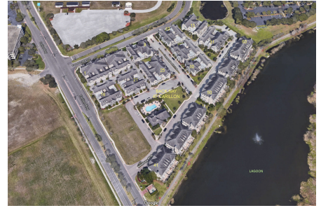
Built in 2007 - 55 units - 3 floors

Back Bay at Carillon 530 Gilman Place North, Saint Petersburg, Florida 33716 727-685-8484 https://backbaystpete.com/