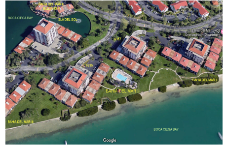
Built in 1981 - 152 units - 6 floors

BAHIA DEL MAR CONDOMINIUM ASSOCIATION NO. 2 5901 SUN BOULEVARD, SUITE 103 ST PETERSBURG, FL 33715