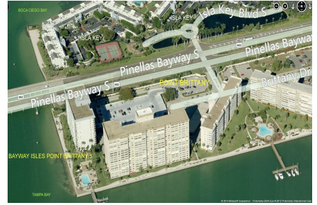
Built in 1972 - 133 units - 15 floors

POINT BRITTANY HOMEOWNER'S ASSOCIATION, INC. 4900 BRITTANY DR S SUITE 201 ST. PETERSBURG, FL 33715 (727) 866-2655