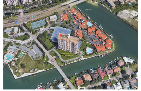
Built in 1974 - 228 units - 18 floors

Bayway Isles Homeowners Club Inc Address: 5650 Leeland St S, St. Petersburg, FL 33715 Bayway Entryway Security 867-7586 https://www.baywayisles.com/