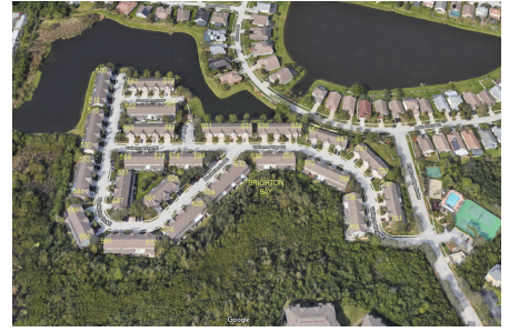
Built in 2002 - 150 units - 2 floors